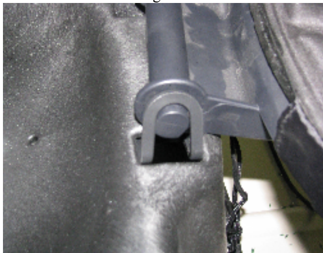
Fig # 3